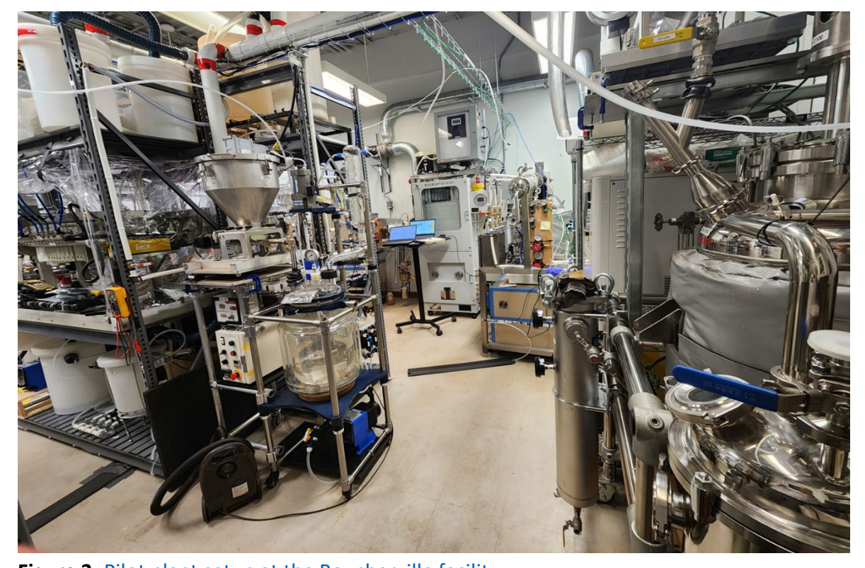
Figure 3: Pilot plant setup at the Boucherville facility